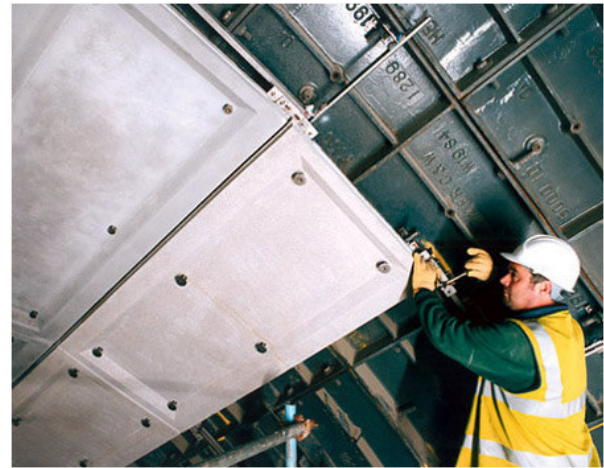
GRC Panels being installed