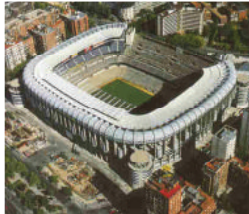
Figs. 3 & 4: The Santiago Bernebeu Stadium after the second refurbishment to new meet UEFA Regulations