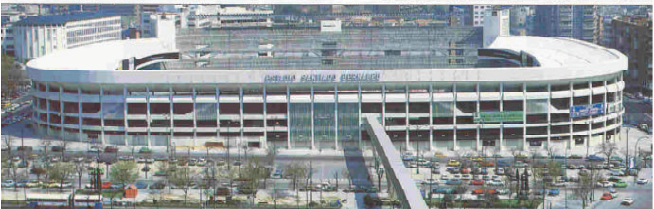
Fig. 2: After the first refurbishment, for the World Cup Championships in 1982

The new enlargement, to meet the UEFA regulations on spectator seating, made it necessary to extend the stadium upward and outward to create a second tier of seating. In order to achieve this economically, the existing steel structure was extended and this in turn, placed a maximum weight limitation of 53kg/m 2 on the cladding panels to be used.