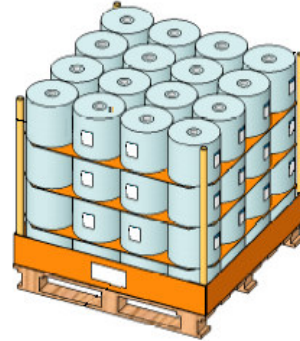
Without Individual Carton Boxes