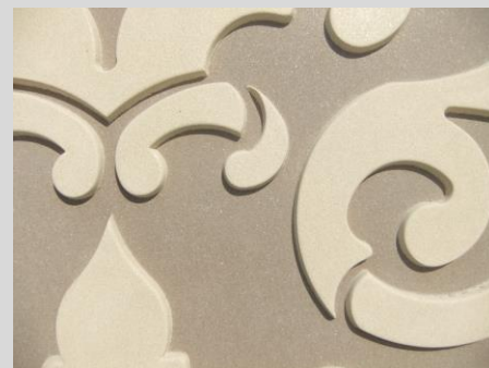
Samples of finishes

The range of finishes for GRC can also be enhanced by the use of natural stone veneers (e.g. granite, marble, limestone, etc). In this case particular care should be taken regarding differential expansion and contraction of the two materials due to temperature and moisture changes. (Examples of suitable attachment methods for veneers can be seen in the “PCI Recommended Practice for GFRC Panels”).