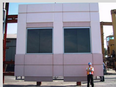
Panel assembly prepared for installation