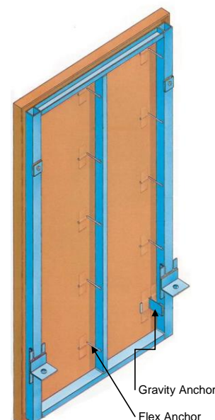
Typical stud frame fixing assembly

The methods of designing GRC façade panels are well documented, and reference can be made to the “Cem-FIL® GRC Technical Data Manual”, “PCI Recommended Practice for GFRC Panels”, and “GRCA Practical Design Guide”.